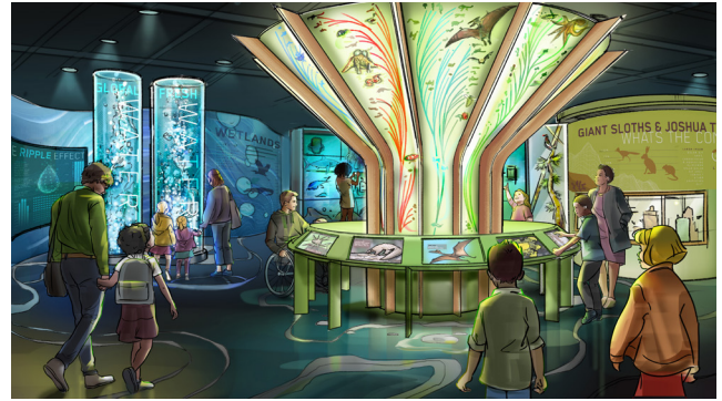
Changing Earth - Life - Biosphere Rendering